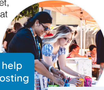
Stanhope Summer Fun Day 2025

If you'd like to get involved and help with organising the fair, we're hosting planning meetings at the Hub: